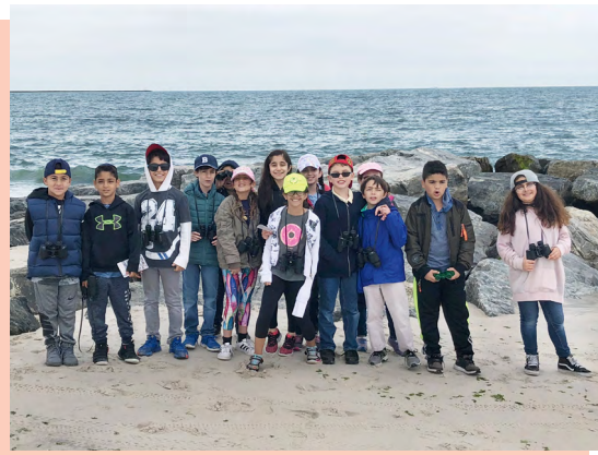
Young people all around the U.S. are sharing what they know to protect coastal critters and habitats.

So participants in the annual event clean up trash along seashores, but also along lakes, streams, and rivers, too. How many participants and how much trash? In 2017, 800,000 volunteers removed more than 20 million pieces of trash from beaches and waterways around the world!