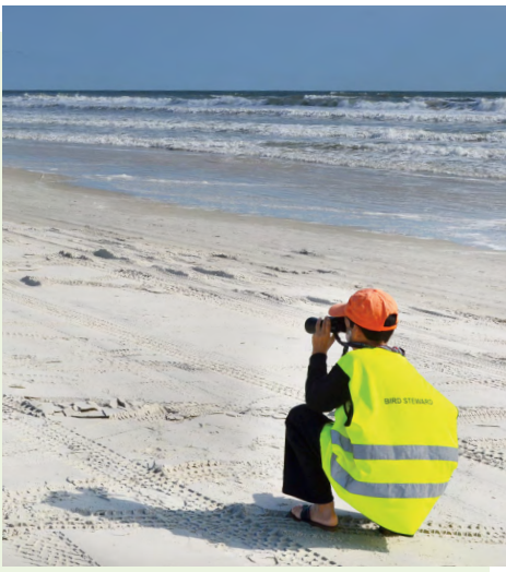
A young beach steward observes nesting shorebirds from a safe distance.

The United States has almost 90,000 miles of coastline along the Atlantic and Pacific Oceans and the Gulf of Mexico. And there are thousands more miles of freshwater shoreline along the country's lakes and rivers. Protecting those habitats for wildlife and for people is a big job, and a lot of young people are volunteering as beach stewards to help out. Beach stewards make signs, patrol beaches, and answer questions about birds and other wildlife. When nesting season begins, the work of beach stewards becomes even more important. They help rope off nesting areas and talk with beachgoers about how to enjoy the sun, surf, and sand while sharing the shore with birds that lay their eggs and raise their young right there on the beach.