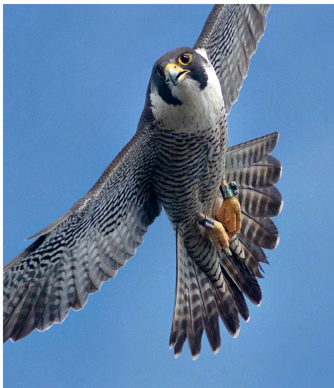
The bands on the legs of this Peregrine Falcon help scientists track its migration.